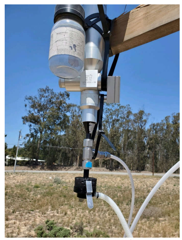
Figure 1: Scripps's PM_{2.5} sampling setup for 2021. Note the T fitting and bypass flow between the VSCC and the sample holder.