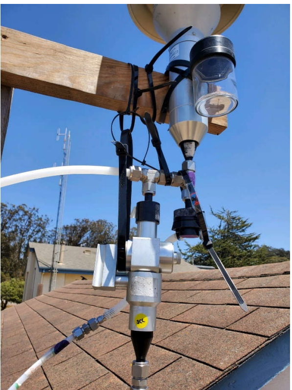
Figure 2: Scripps's PM_{10} sampling setup for 2021. Note the T fitting between the PM_{10} head and the sample holder. The split-off flow is further split by a second T before a portion is run through an SCC.

isokinetic sampling of particulates will result in under-sampling of sample mass, and that is likely what is occurring here. Turbulence introduced by the T fitting may also cause particles to be deposited on the sides of the downtube, rather than traveling down to the filter. The report provides no data and cites no references to demonstrate that these novel devices perform as they assume.